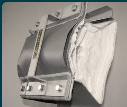
Expansion joint units are delivered ready for installation in the ductwork