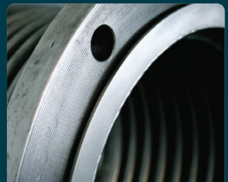
All Sealing Projex products focus on superior quality and special design solutions