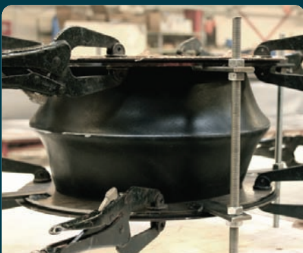
Numerous special designs and custom-made Fabric Expansion Joints

Design calculations are carried out according to counting standards and can be documented by optional testing procedures.